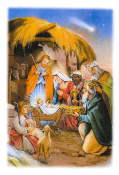
Archdiocese of Birmingham Holy Family RC Parish 763 Coventry Road, Small Heath Birmingham, B10 0HT